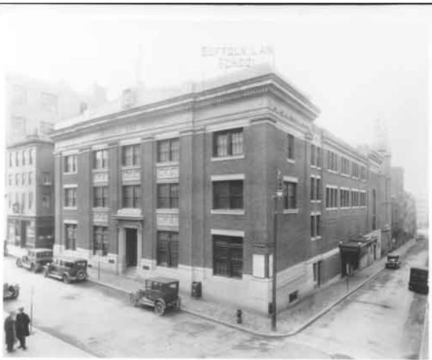
Exterior view of the Archer Building (20 Derne St.), showing Suffolk Theatre off the Temple Street entrance, ca. 1930s.

Create the desired, Maintain the required, Destroy the expired!