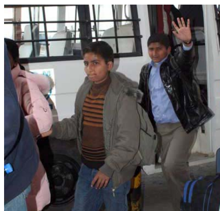
Bhutanese refugees arriving at the Tribhuvan International Airport to fly to the USA for resettlement on Monday, Mar 10 08. 20 Bhutanese refugees left for America today.

This announcement however sparked heated debate amongst the refugee population. The older generation was wary and did not like the idea of third country resettlement whereas the younger generation were tired of staying in the camps and supported the resettlement as an opportunity to start fresh. There were several incidents of clashes between the refugees in the topic of resettlement. In May 2007, clashes in Beldangi II refugee camp between groups with differing opinions over third country resettlement