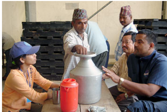
Bhutanese refugees in Nepal held elections over the course of 3 days (May 2 to 4, 2006) for their camp representatives, casting ballot papers in containers usually used to store drinking water.

The Bhutanese refugee camps are huts made of mud, straw and local materials (thatched huts). The camps have water and sanitation facilities and are often praised for the quality of services offered to the refugees. In addition, the refugees themselves are involved in the leadership and daily administration of the camps ensuring participatory approach to camp management. The elections to choose camp management representatives from the refugee population had begun since 1992. Refugees eagerly look forward to Election Day and the opportunity to exercise their democratic right to vote – even though it is in a refugee camp far from their homeland. UNHCR has also taken a lead in involving women participation for these elections.