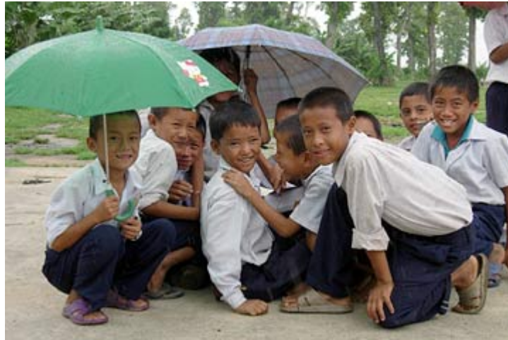
Bhutanese refugee school boys shelter from the monsoon rains in Khudunabari camp in Jhapa district, eastern Nepal. Most of them were born in exile and have never seen Bhutan.

Some drop their studies and loiter, they remain idle. The frustration is increasing all the time.” 20