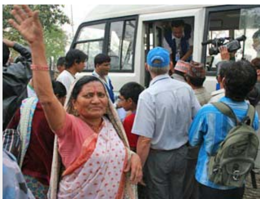
A US-bound refugee bids her friends and relatives goodbye in eastern Nepal's Sanischare camp.

Due to the protracted situation, 15 rounds of failed bilateral negotiations and growing impatience of the refugees, the chances of repatriation had grown slim. However, some Western countries expressed a strong interest to UNHCR in resettling some of the refugees. In Oct 2006, US Assistant Secretary of State for Population, Refugee and Migration Affairs Ellen Sauerbrey announced that the US was offering to resettle 60,000 Bhutanese refugees from Nepal. Canada, Australia, Norway, Netherlands, New Zealand and Denmark have each offered to resettle 10,000 refugees. 29 The High Commissioner António Guterres during his 23 May 2007 visit to Nepal made it clear that the choice of resettlement or repatriation would be up to the refugees and no pressure should be exerted on them. 30