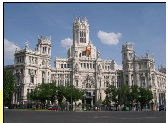
Downtown Madrid – Cibeles

Center for International Education Boston, MA Tel. (617) 573 8440