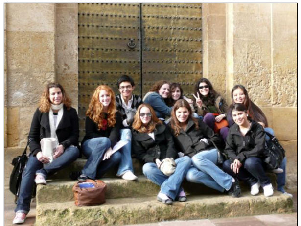
Excursion to Córdoba - Spring 2008

Spring Semester. Weather during the Spring Semester will range from very cold in January (when you arrive), and all through the winter, to quite warm (May). Winter temperatures might be as low as 30°F/-1°C , while spring temperatures might be as high as 70°F/21°C (especially in May).