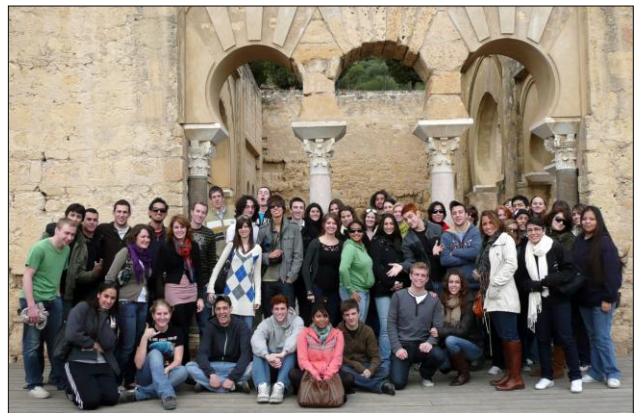
Intercultural Orientation Workshop in Andalusia – SP08