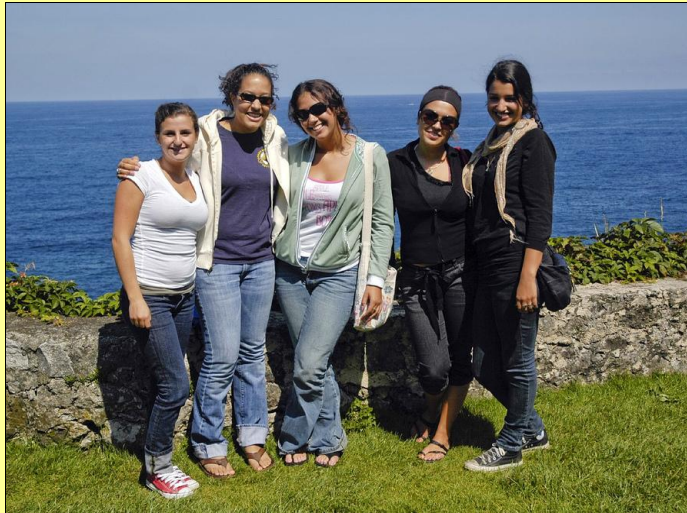
Intercultural Orientation Workshop in Asturias – FA07

Fees and Payments Money and Finances Weather in Spain What to Pack Academic and Cultural Orientation How to Budget Safety upon Arrival Arrivals in Madrid Directions to the Campus Dealing with Culture Shock Keeping in Touch with your Family Important Telephone Numbers