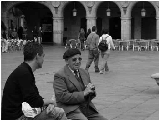
The Plaza Mayor in Salamanca

This fall, SUMC is pleased to start the semester with an all-campus Welcome Trip in the province of Salamanca, located west of Madrid, near the Portuguese border. Over four days, students and members of the faculty and staff will make their base at the Universidad de Salamanca, the medieval city famous for its renowned university.