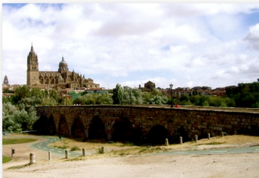
Salamanca's cathedral and Roman bridge

Students will tour the heart of Salamanca, starting in its Plaza Mayor and moving on to the Cathedral. A chance to walk on the roof will also be offered, for some spectacular views!