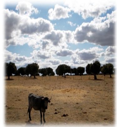
A bull grazing at Finca Valverde

The province is particularly rich; its Roman history, natural resources, and distinct Castilian culture make it one of Spain's most interesting and delightful regions.