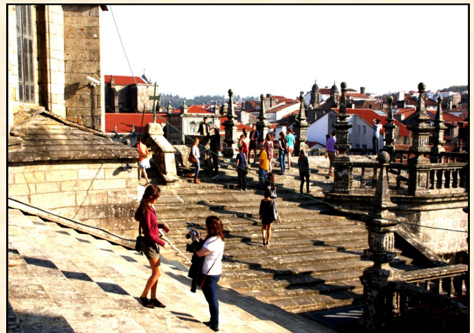
SUMC students shown touring the Cubiertas de la Catedral de Santiago, or Cathedral rooftop.

SUMC students recently traveled to the heart of Galicia, Santiago de Compostela. Characterized by rainy skies, moss-covered buildings and grassy hills, Santiago enjoyed three days of unusually sunny skies and warm temperatures in September, offering visitors its finest welcome. Students wandered the narrow cobbled streets of the old city, lined with crafts, foods and jugglers in the medieval fair under way that weekend. A Sunday morning vision of Santiago from atop the cathedral gifted students with an omniscient perspective of the city. Modern-day pilgrims nearing their journey's end were rewarded with the sweet sounds of bagpipe, hammer dulcimer, flute and guitar wafting through the air from musicians in the streets.