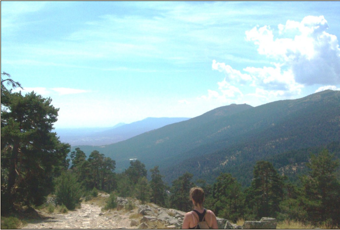
Student Lauren Lopez shown on the Roman Road in Cercedilla.

In mid September, a group of SUMC students boarded a train in Madrid and an hour later were hiking along Cercedilla's Calzada Romana (old Roman Road) that leads up to the pass of La Fuenfría . From start to finish, hikers climbed 2,000 feet along 9 miles, on stretches of ancient road dating back to the first century A.D. A traveler's treat unknown to many visitors, Cercedilla awaits newcomers with a natural charm that seems to say, "Come away and experience the majestic views from my mountaintops. They are second to none."