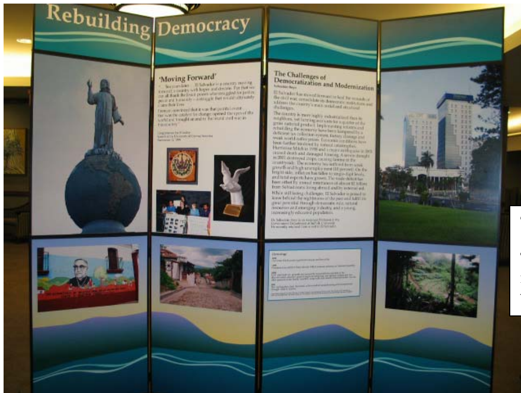
“Rebuilding Democracy” This panel describes the issues facing El Salvador today.