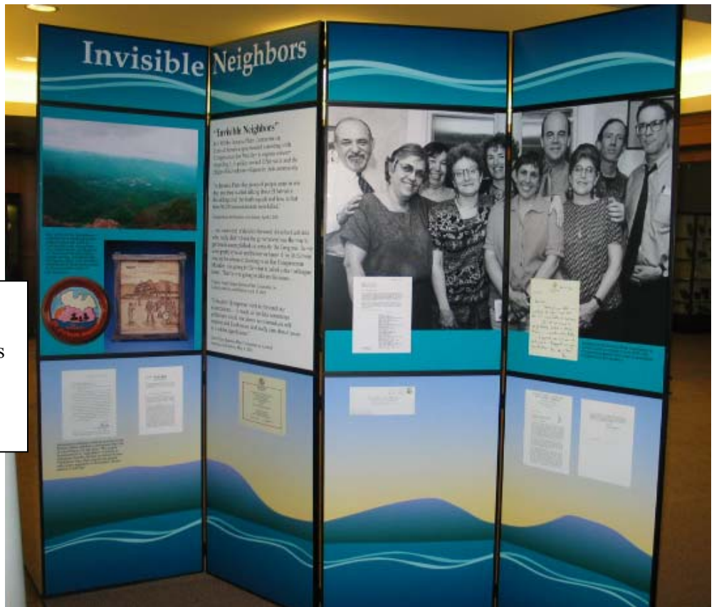
“Invisible Neighbors” This panel discusses the joint efforts of Moakley and the Jamaica Plain Committee on Central America to aid Salvadoran refugees.