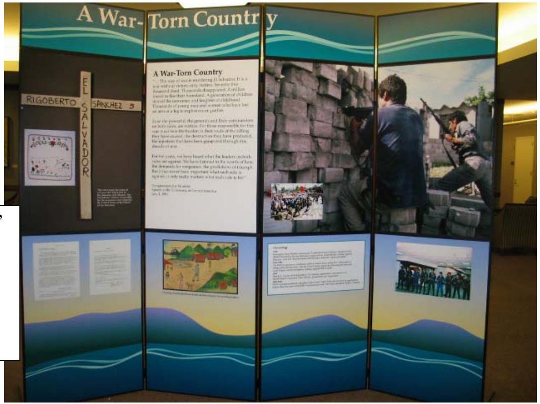
“A War-Torn Country” This panel describes the period of civil war and political unrest that El Salvador endured for almost fourteen years.