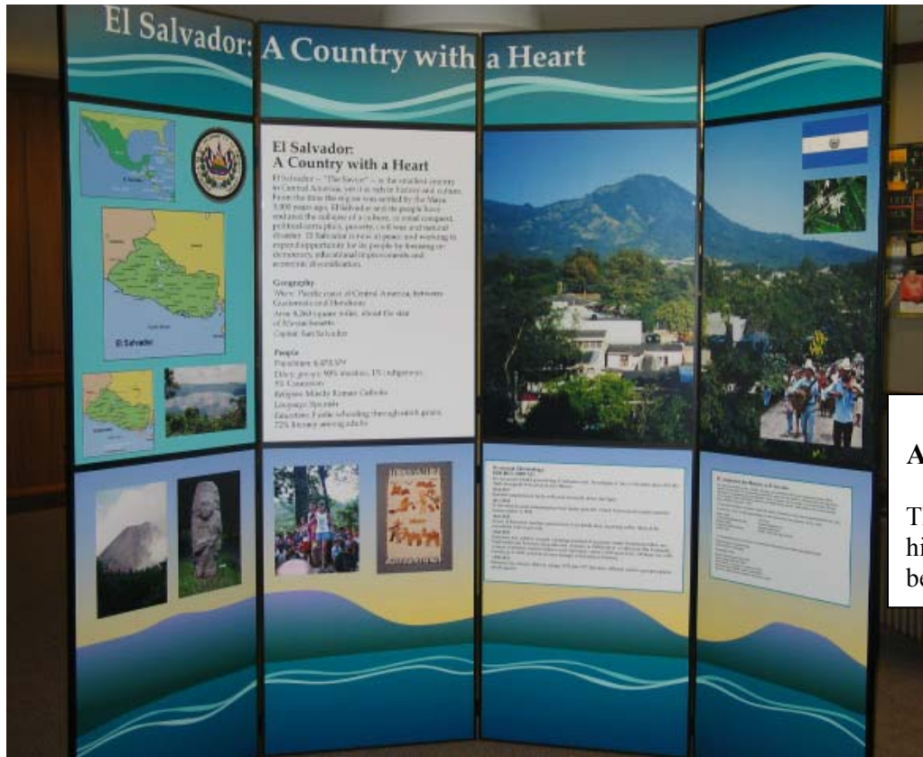
“El Salvador: A Country with Heart” This panel illustrates the history and natural beauty of El Salvador.