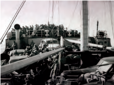
NDMC evacuating to Taiwan.