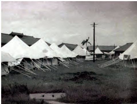
Kunming supplies. Kunming was the main supply depot at the end of the trans-Burma airlift.