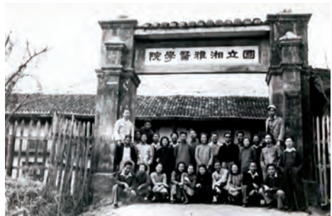
Students of National Xiangya Medical College.