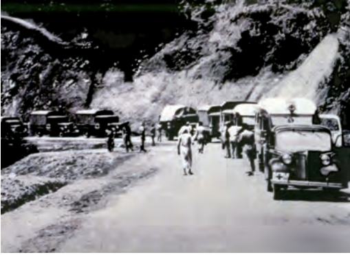
Burma Road convoy, c. 1940. Construction of the Burma Road was one of the most arduous public works projects carried out by the Nationalist government during the wartime era.