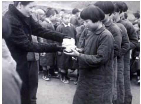
Mme. Chiang Kai-shek with war orphans. Mme Chiang took a close interest in military and civilian relief and served as health policy advisor to her husband.