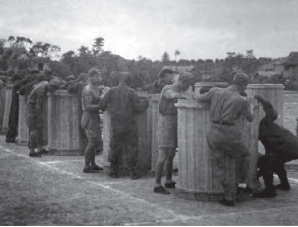
Delousing station. The Chinese Red Cross Medical Relief Corps started a delousing, bathing, and scabies program in September 1938, setting up seven stations at army medical hospitals. These vats were mostly improvised from whatever materials were available.