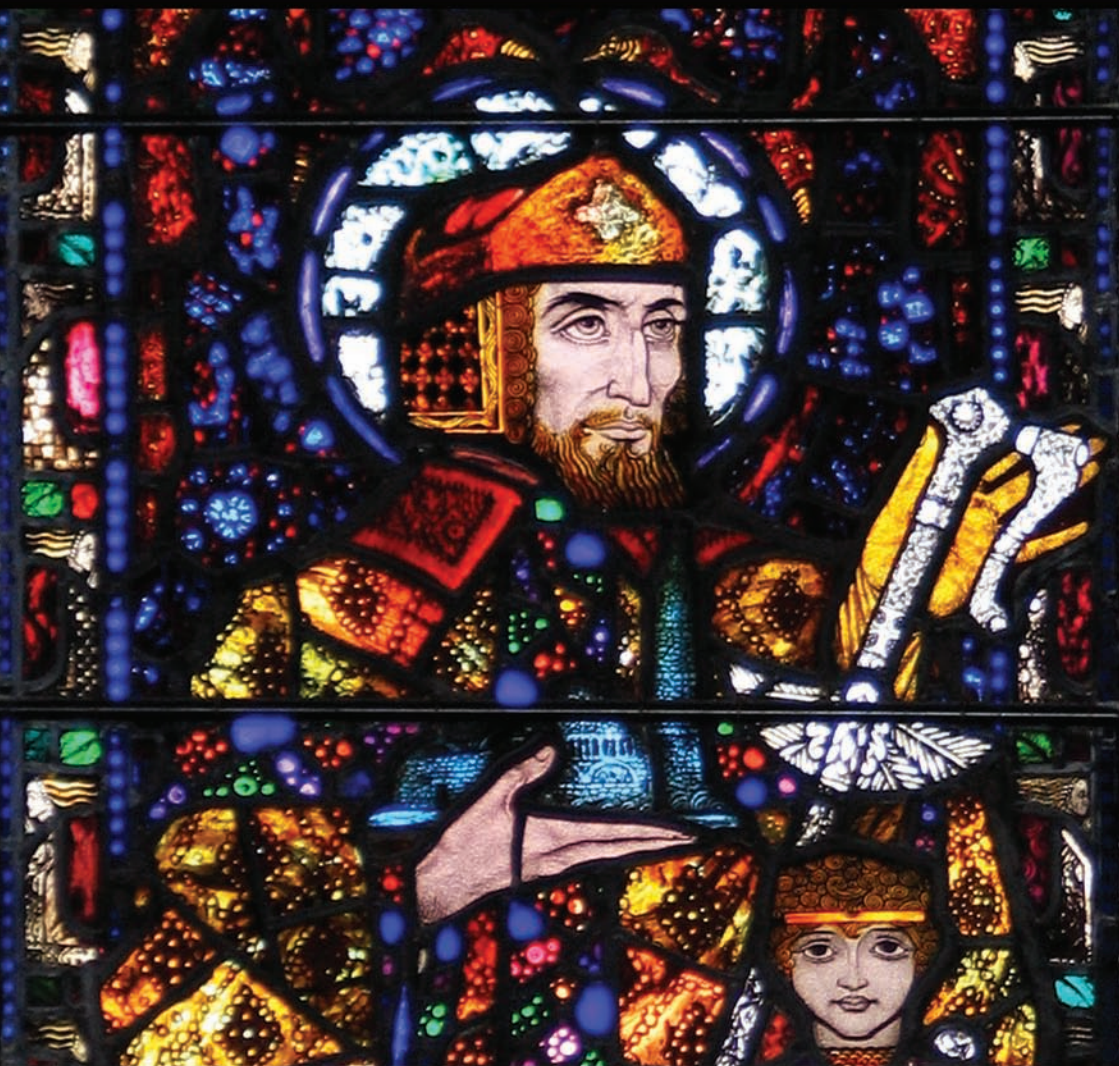
St Declan (c. 1916) by Harry Clarke, detail of stained glass window in the Hogan Chapel, UCC.

IMAGINATION AND THE MAKING OF IRISH IDENTITY