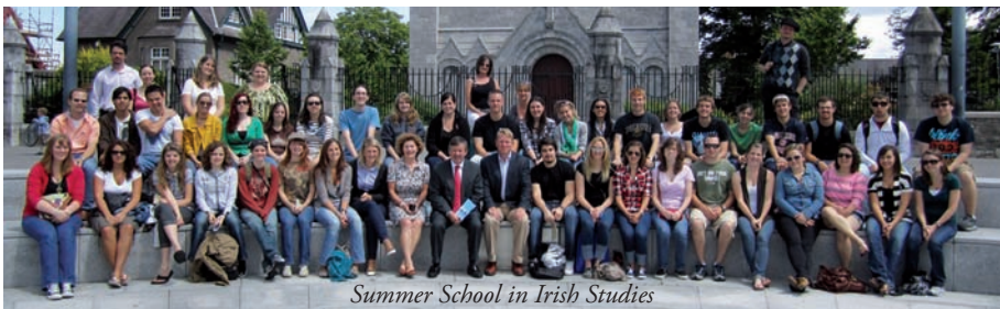
Summer School in Irish Studies

The Summer School in Irish Studies in UCC aims to provide a unique learning experience by combining a rigorous introduction to major academic themes in the development of Irish identity with an opportunity to encounter Ireland's rich cultural landscape.